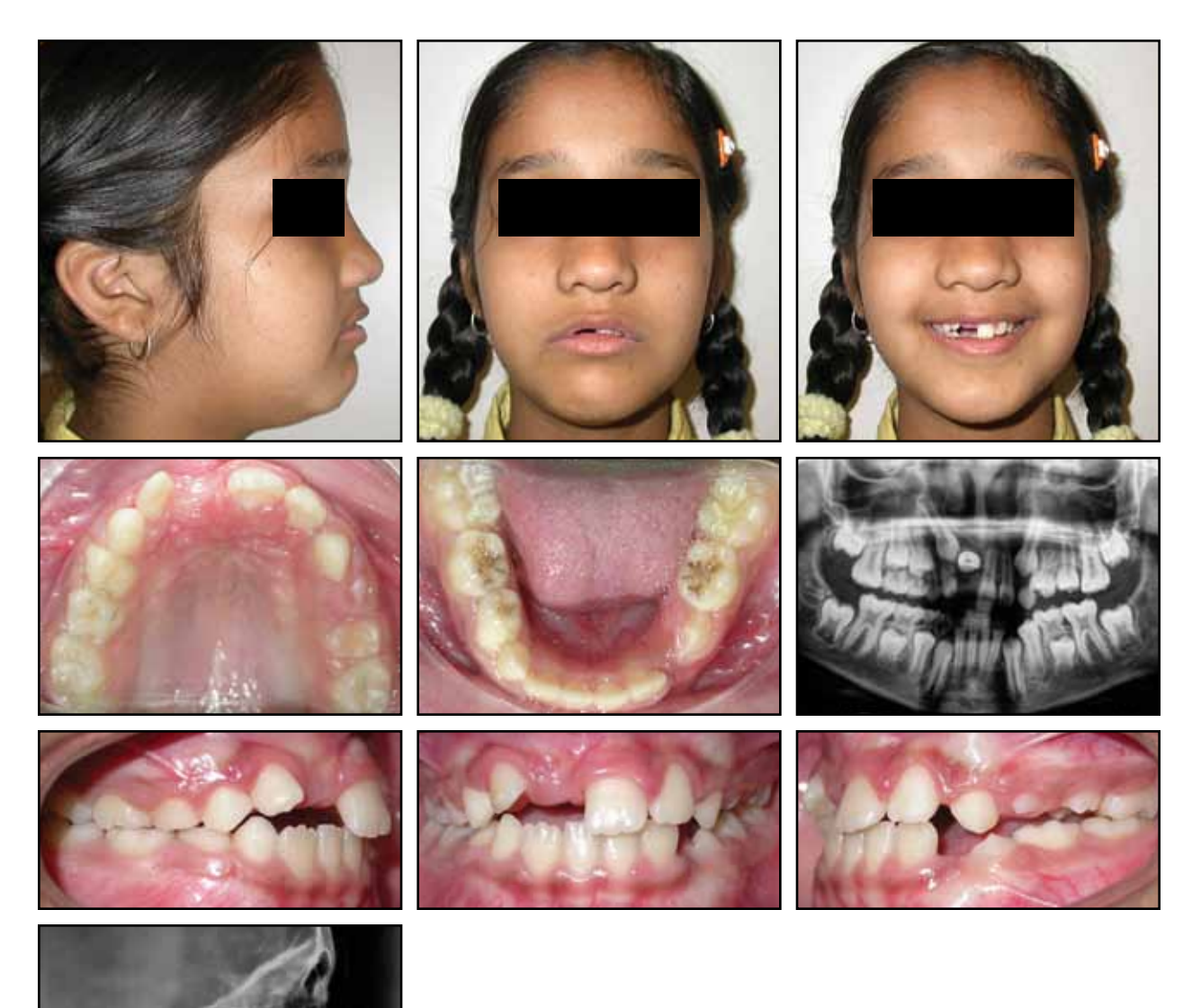
Fig. 2 9-year-old female patient with impacted maxillary right central incisor and canine before treatment.