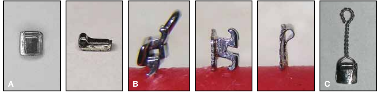
Fig. 1 Multi-Purpose Attachment (MPA) front and profile views (A) compared with standard brackets (B); MPA with hook formed from twisted ligature wire (C).

*Braces Ideas, 2/13, Madhav Nagar, S.V. Road, Andheri (West), Mumbai 400058, India; www.bracesideas.com.